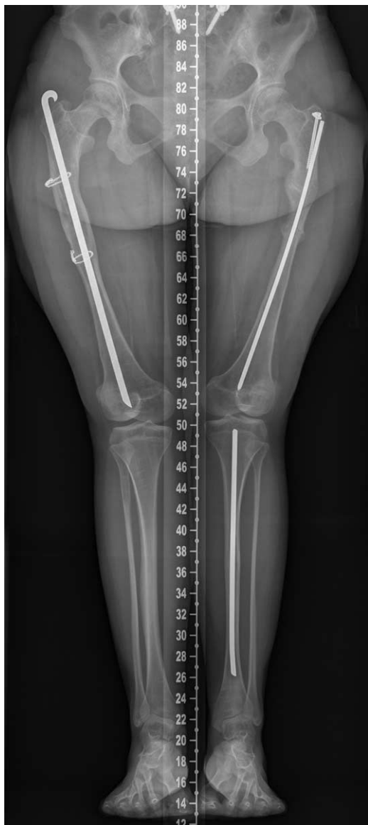
Figure 1. Scanography showed genu valgum and small bilateral femoral canal.

she walked with a waddling gait. The patient's bone survey revealed loss of kyphosis of the thoracic spine with left pelvic tilting, cubitus varus over the left elbow, and a neglect fatigue fracture with healing over the base of the fifth metatarsal bone of the right foot. Her neurovascular examination was normal. Significant findings other than the musculoskeletal system included blue sclera and severe heat or sweat rash over the skin of the trunk.