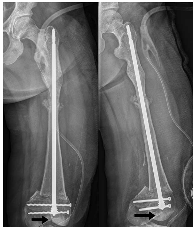
Figure 2. Distal left femoral condylar fracture while inserting the female rod.

Because this report just reviewed previous data and did not involve any human trials, there is no need to conduct special ethic review, and the ethical approval is not necessary. Informed consent was provided by the patient for the publication of the case report.