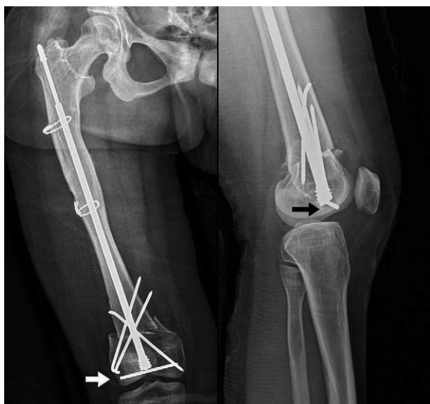
Figure 3. Stop K-pin used to prevent dropping of the male rod in right femur.

later. First, an optimal entry portal was created in the center of the intercondylar notch approximately 1 cm anterior to the origin of posterior cruciate ligament, because the portal at the left distal femur was too anterior. The second measure taken was to ream the entry hole to a larger diameter to accommodate the large head of the female nail to prevent a split fracture of the femoral condyles. However, due to the pre-existing canal produced by the previously inserted Rush pin, the tip threads of the FD male nail could not find adequate anchorage at the greater trochanter of the right femur. To restrain the male nail from dropping down, a horizontal stop Kirschner pin was inserted close to the distal end of the female nail. To augment the stability of the corrective osteotomy, 3 crossing Kirschner pins were inserted at the right distal femur (Fig. 3). Postoperatively, a long-leg splint was applied on the right side, and the patient was discharged from the hospital 2 days after the second operation.