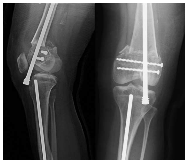
Figure 4. Downward protrusion of the left female nail 2 weeks after surgery.

The patient was allowed nonweight-bearing ambulation until approximately one and a half months after the operations when radiographs revealed healing callus formation at the osteotomies bilaterally. The splints at both sides were subsequently removed. Three months after surgery, follow-up radiographs revealed additional healing callus at the osteotomy sites (Fig. 5) and the patient was allowed full weight-bearing during indoor ambulation which she achieved without discomfort. The genu valgum deformities were corrected, the left thigh pain subsided, and the patient was satisfied with the procedures.