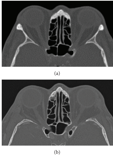
FIGURE 2: Preoperative (a) and postoperative (b) axial CT scan of the orbit. Note the missing lateral orbital wall after bony decompression without repositioning of the orbital rim.

steroids and immediately underwent additional medial wall decompression. Both patients showed a rapid restoration of visual acuity within one week after additional endonasal medial wall decompression surgery.