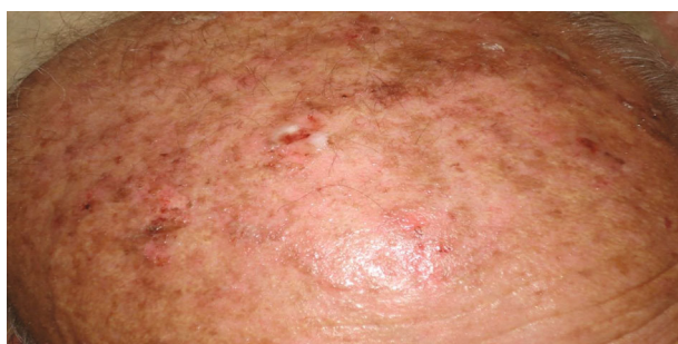
FIGURE 2: Bullous blisters on the scalp.