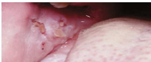
FIGURE 3: Erosions on the buccal mucosa.

Biopsy of skin lesions from fresh vesicles showed a suprabasal cleft formation and a row of “tomb-stone” appearance of basal cells. Direct immunofluorescence showed deposition of IgG in epidermis (Figure 4). The diagnosis confirmed as pemphigus vulgaris (Table 1).