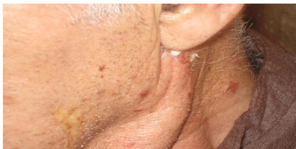
FIGURE 1: Bullous blisters on the face.