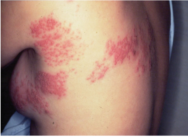
Figure 1. Classical herpes zoster in the left T4 dermatome. Note the concentration of lesions in areas of the dermatome innervated by the posterior primary division and the lateral branch of the anterior primary division of the left T4 spinal nerve.

latent virus to reactivate and multiply to cause HZ (Figure 2). He further postulated that this immunity to VZV decreases over time until it falls below a critical threshold, permitting latent VZV to reactivate, multiply, and spread, resulting in HZ. Hope-Simpson [15] also proposed that subclinical VZV reinfection