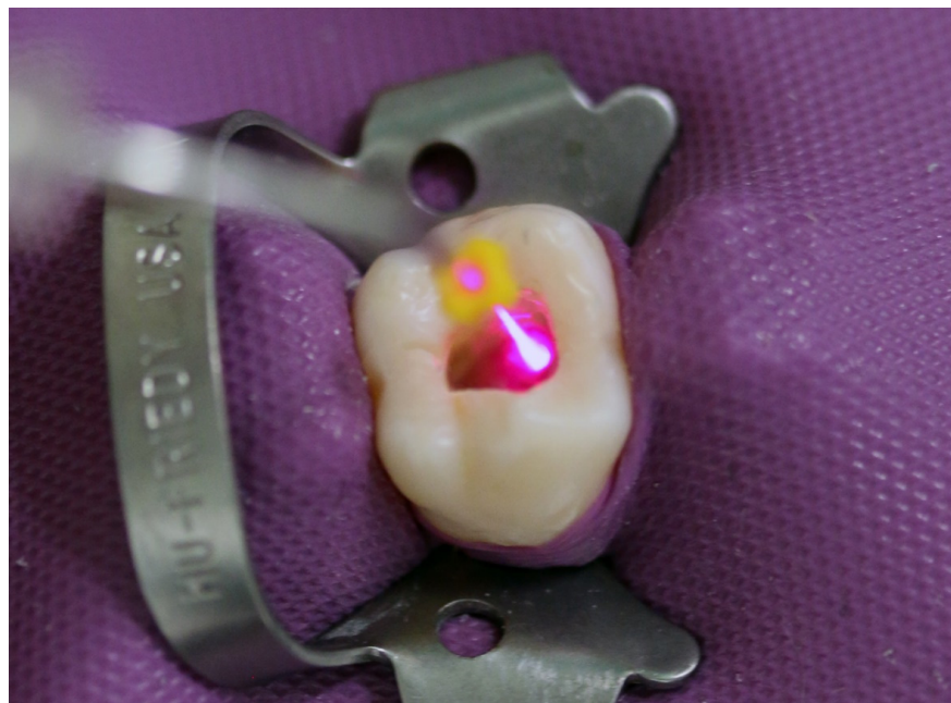
Figure 1. Representative picture of adjunctive laser disinfection during root canal treatment.

Final rinsing with sodium hypochlorite was then performed in all groups before a calcium hydroxide paste (Calcicur; Voco GmbH, Cuxhaven, Germany) was applied to the