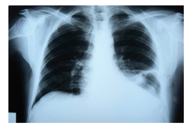
Figure 4. Pre-treatment PA chest radiograph of the case 2: a large pleural effusion evident in the left hemithorax was seen.

A 53-year-old male patient with newly developed abdominal distension, ascites and left sided pleural ef-