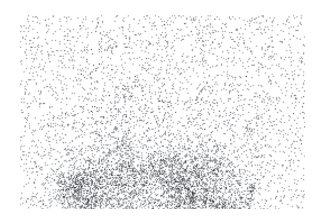
Figure 5. Peritoneal scintigraphy of the case 2 at 24 h: at 10 min, the tracer was diffused in the abdominal region, which confirmed that it was injected in the peritoneal cavity; at 6 h and 24 h, the tracer was seen in the region of abdominal cavity, but not in the thoracic region. This image suggested no peritoneopleural communication in the case 2.

fusion was referred. During the diagnostic work up, he was found to have alcoholic liver disease. PA chest radiograph of the patient showed, clearly, a large pleural effusion in the left hemithorax (Fig. 4). Prompt aspiration of fluids revealed an exudate type pleural effusion with a low albumin gradient ascites (Table 1). After injection of <sup>99m</sup>Tc sulfur colloid into the peritoneal space, no accumulation of radioactivity in lung region was observed up to 24 h (Fig. 5). According to the peritoneal scintigraphy, absence of peritoneo-pleural communication was considered and further diagnostic work up was initiated. Computed tomographic examination of thoracic and abdominal cavities did not yield certain diagnosis even though there was a fluid accumulation with fibrotic changes in pleural and peritoneal membranes. Broncoscopic evaluation of airways with aspiration of broncoalveolar fluid confirmed lung tuberculosis, and laparascopic evaluation of intra abdominal cavity with peritoneal biopsy confirmed peritoneal tuberculosis with final demonstration of tuberculosis bacilli itself. An anti-tuberculosis treatment was started. Post-treatment PA chest radiograph demonstrated the absence of the effusion (Fig. 6).