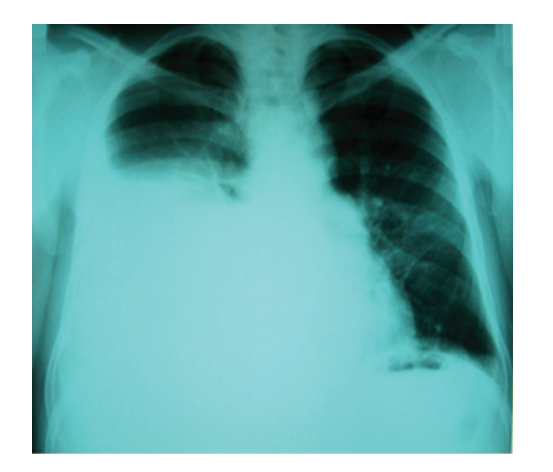
Figure 1. PA chest radiograph of the case 1: a large pleural effusion was seen in the right hemithorax.

Two (one hepatitis B virus and one alcohol-related) cirrhotic patients with ascites and pleural effusions were evaluated to determine the cause of fluid accumulation and were searched whether there was a communication between peritoneal and pleural cavities. In addition to clinical evidence of ascites and pleural effusion, patients were also confirmed by paracentesis and thoracentesis of fluids. Protein content