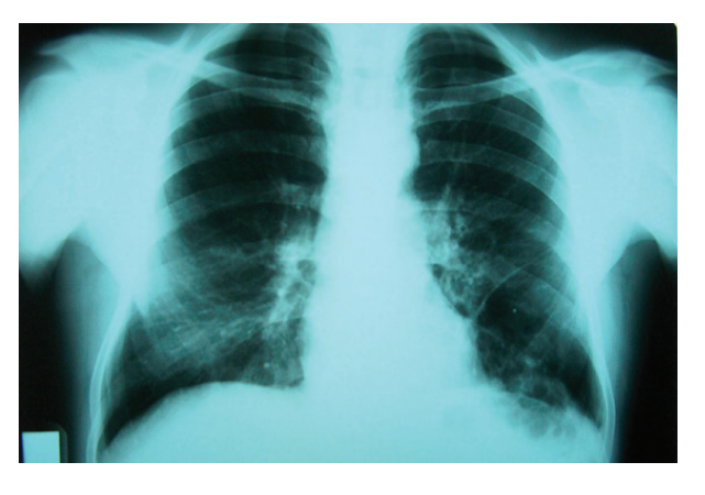
Figure 3. Post-treatment PA chest radiograph of the case 1: no evidence of pleural effusion was seen.

and right sided pleural effusion. Posteroanterior (PA) chest radiograph of the patient demonstrated a large pleural effusion evident in the right hemithorax (Fig. 1). Prompt aspiration of thoracic fluid with paracentesis was performed. The biochemical examination of fluids revealed a transudate type pleural effusion with a high albumin gradient ascites (Table 1). After injection of <sup>99m</sup>Tc sulfur colloid into the peritoneal space, rapid accumulation of radioactivity in the right pleural effusion was noted (Fig. 2), suggesting a peritoneo-pleural communication. With the treatment of ascites via paracentesis, salt restriction and diuretics ascites disappeared as well as the pleural effusion decreased to minimal levels. PA chest radiograph demonstrated the absence of the effusion (Fig. 3).