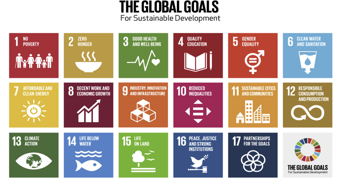
Figure 1 | The 2030 Agenda for Sustainable Development, adopted by all United Nations member states in 2015, provides a shared blueprint for peace and prosperity for people and the planet, now and into the future. United Nations Sustainable Development Goal no. 3 commits the planet to reducing premature mortality due to lifestyle diseases by one-third.

massive migration of "environmental refugees," with subsequent increased risk of conflicts and epidemics, adding more pressing challenges for the global nephrology community. We have already seen that increases in intense weather events, such as hurricanes, owing to climate change, have damaging effects on the provision of care to dialysis patients.<sup>7</sup>