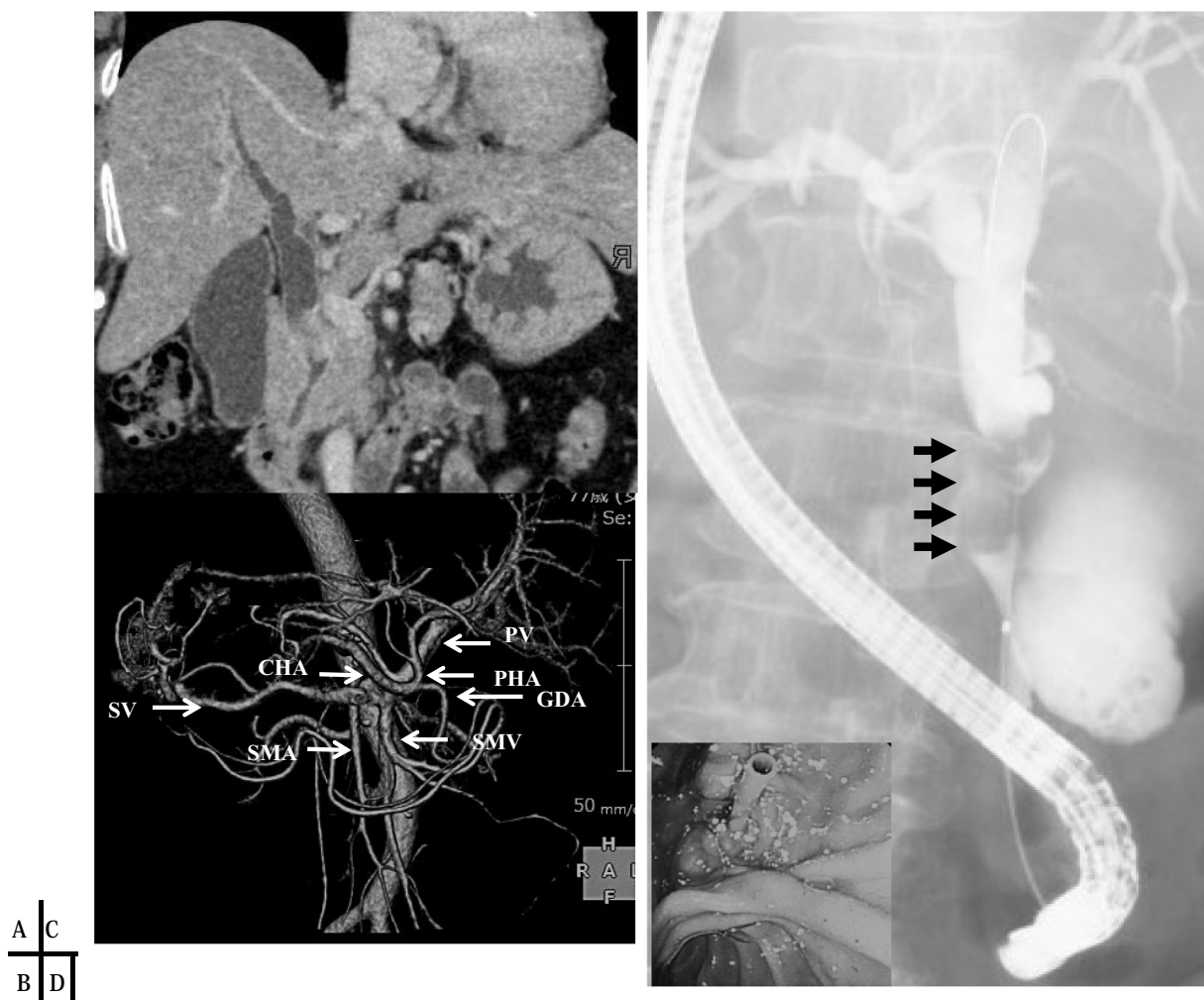
Fig. 1. (A) Abdominal CT shows the stricture of the common bile duct with upstream dilation of the bile ducts. (B) Left-to-right reversal of the vascular arrangement with no vascular malformations. (C) ERCP confirms the stricture of the common bile duct (arrows), and the endoscopic view shows stent for stenosis of the distal common bile (D).

Situs inversus, itself, has no pathological significance; clinically, the problem is that there are often complicating deformities, e.g. in the