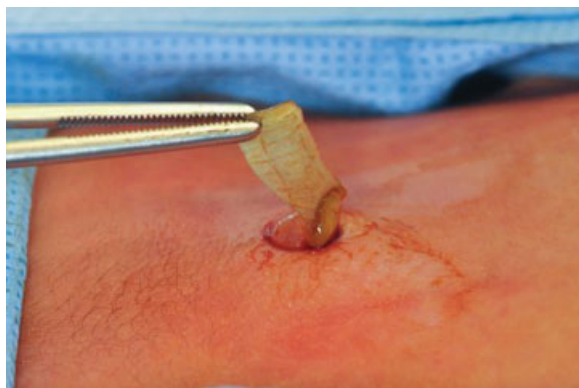
Fig. 2 Neonatal gross appearance of skin appendage.

identified. MRI of the spine confirmed the diagnosis of dorsal dermal sinus extending from dural sac, between L4 and L5 and superiorly to the 3 cm skin appendage at the L3 to L4 level (→ Fig. 3 ). There was no tethering of the spinal cord and the vertebral bodies were noted to be intact. On the 8th day of life, surgery was performed, including excision of the dermal sinus tract and resection of the meningeal tenting at the level of the dural sac. The skin around the dermal sinus was excised then undermined and using the operating microscope, the sinus was dissected along its margins until the dural sac was reached (→ Fig. 4 ). No leakage of cerebrospinal fluid was observed from the dural sac, nor was there any neural tissue