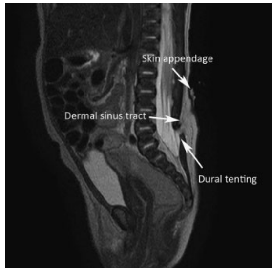
Fig. 3 Neonatal magnetic resonance imaging of the lumbar spine with radiologic diagnosis of dermal sinus tract, dural tenting, and skin appendage.

in the tract. The tract was closed and flaps were dissected to provide for defect closure. The diagnosis of lumbar dermal sinus tract with associated meningeal tenting was confirmed by the histopathologic examination. Postoperatively, the neonate recovered uneventfully.