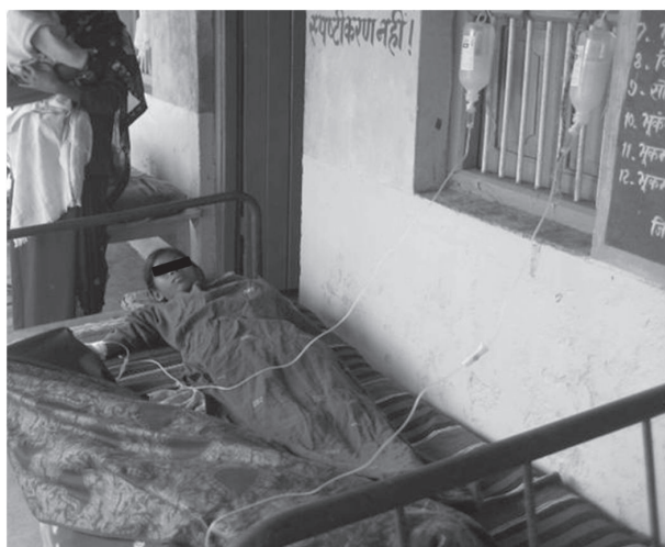
Figure 1. Young female patient with visceral leishmaniasis receiving liposomal amphotericin B infusion at Vaishali District Hospital, Bihar State, India.