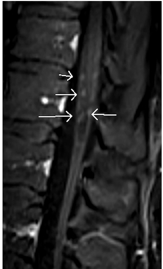
FIG. 2. Sagittal MRI T1-weighted postcontrast image with enhancement along the conus medullaris and cauda equina concerning for leptomeningeal disease. Arrows identify areas of enhancement.

The dura was incised in the midline and tacked back with Nurolon sutures. The underlying arachnoid mater was then incised using microscissors. The midline raphe was cauterized using bipolars, and the pia mater was incised using an 11-blade scalpel. Microinstruments were used to dissect in the midline and approached abnormal tissue within a few millimeters.