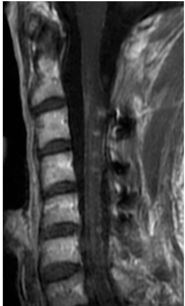
FIG. 4. Sagittal MRI T1-weighted postcontrast image without evidence of any tumor recurrence and resolution of residual hematoma.

positive staining for CD10, melan-A, and SOX10. The BRAF mutation was not detected.