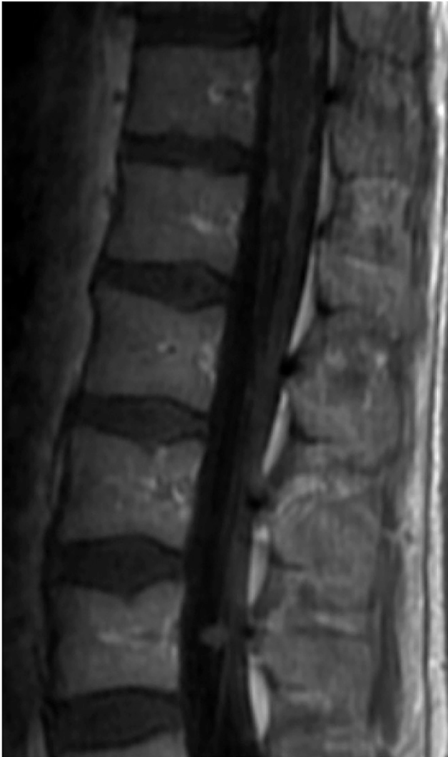
FIG. 5. Sagittal MRI T1-weighted postcontrast image with persistent but stable leptomeningeal enhancement.

symptom is back or neck pain accompanied by a progressive, asymmetrical myelopathy. 3 The average duration of symptoms before pathological diagnosis was 29 months. 10 However, acute decompensation can occur due to hemorrhage. 11 Initial diagnosis requires neuroimaging, with spinal MRI being the best imaging modality due to either melanin's paramagnetic properties or hemorrhagic elements in the tumor. 1