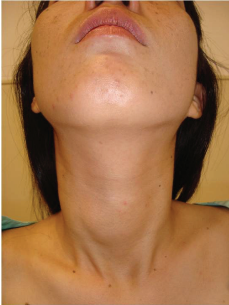
FIGURE 1: Local condition preoperatively.

Case Illustration II. This case is a 34-year-old women with neck swelling for the past 6 months. Clinically, the lump was from thyroid region with benign symptoms. The size was 4 cm, with no cervical lymphadenopathy observed. Laboratory finding within normal limit. Sonography and FNAB findings suggested a benign cyst. We performed right lobectomy endoscopically. Pathologic result was benign thyroid cyst. No further treatment was needed.