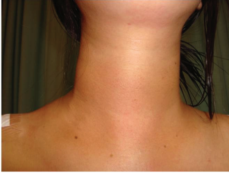
FIGURE 3: Local condition postoperative.