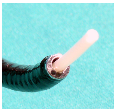
Figure 1 Tip of endoscope, instrument channel and indwelling feeding tube. Endoscope with an outer diameter of 6.0 mm and an instrument channel of 3.2 mm with the intestinal feeding tube exiting the instrument channel.

instrument channel large enough to accommodate the tube for enteral nutrition (Figure 1). The reduced diameter is associated with reduced optical quality and steering capabilities; however, this renders the handling of the new endoscope similar to a bronchoscope and is more familiar to an ICU physician.