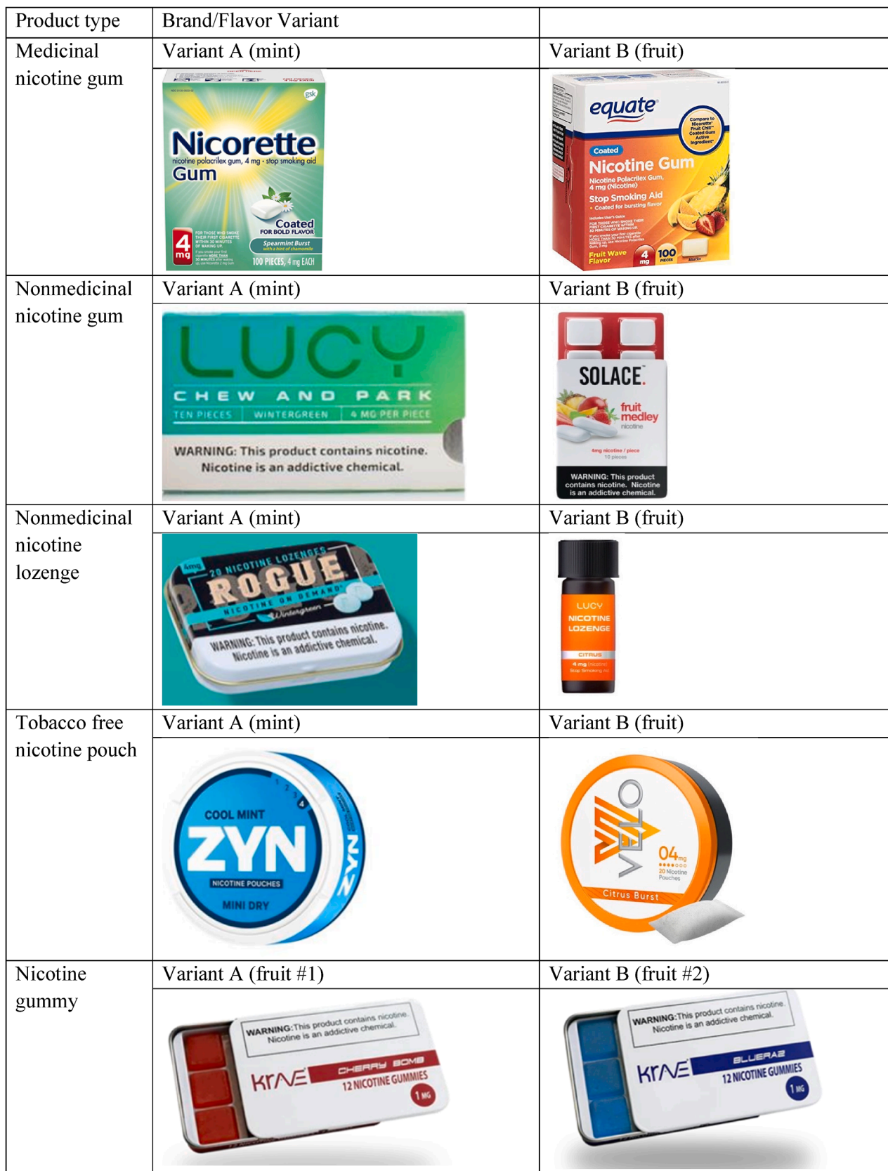
Fig. 1. Images of Oral Nicotine Products Displayed in Use Intention Rating Assessment.