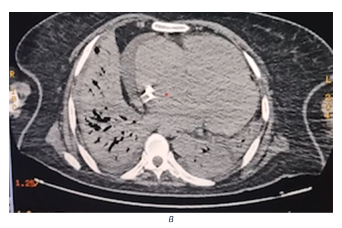
Fig. 1. A: Chest CT on the first day of admission; B: Chest CT on the 36 days of supports VV ECMO.