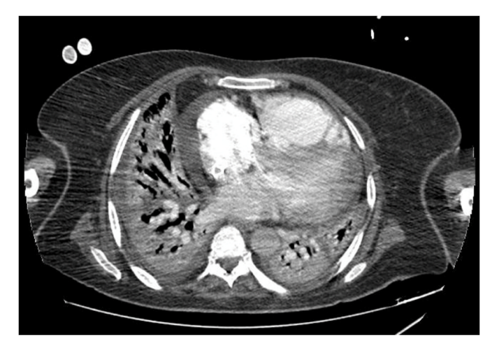
Fig. 3. Chet CT on the 52 day of support VV ECMO.

Hence the interest of a "fully-awake" ECMO strategy in this patient [8]. Indeed, unlike the data reported for COVID-19 patients with an extended support ECMO [5], our patient had only one episode of nosocomial infection, as was noted in the paper of Schmidt and al [9].