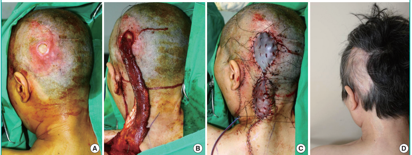
Fig. 2. Posterior neck defect (case 2, patient 10)

A 62-year-old woman presented with a skin and soft tissue defect involving an exposed implanted cranioplasty prosthesis (Medpor) on her posterior scalp. (A) The defect size was 4 \times 4 cm 2 . The exposed cranioplasty prosthesis was visible through the wound opening. (B) Following massive debridement due to a surrounding infection, a 27 \times 6 -cm 2 trapezius muscle flap based on the superior cervical artery was elevated and transferred to the defect without subcutaneous tunneling. (C) The flap donor site and posterior neck incision for flap placement were closed with minimal subcutaneous undermining. An autologous split-thickness skin graft was laid on the remnant skin defect above the exposed muscle flap. (D) Seventeen-month postoperative results showing not only healing of the trapezius muscle flap and overlaid graft but also contouring with adequate thickness and good harmony with the surrounding tissue.