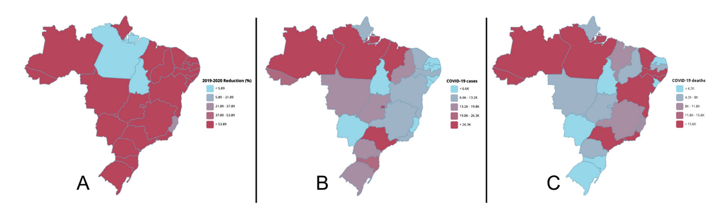
Fig. 2. Graphical comparison considering (A) the reduction of dental procedures provided by the Brazilian public health system in 2020 compared to the same period of 2019, the number of (B) confirmed COVID-19 cases and (C) deaths of the different Brazilian states.