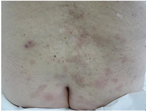
Fig. 3. Lower back after 1 month of oral doxycycline monotherapy.

Sfecci et al.: Extensive Darier Disease Successfully Treated with Doxycycline Monotherapy