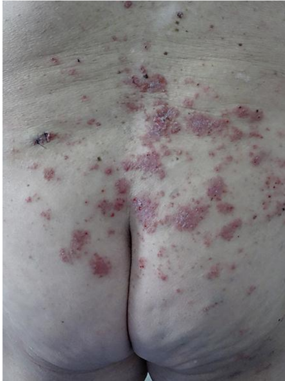
Fig. 1. Lower back before treatment with doxycycline.