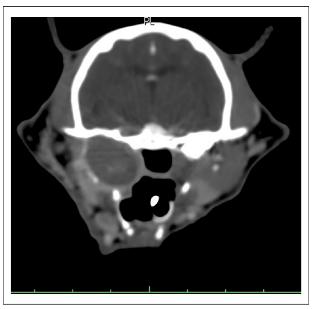
Figure 4 Transverse image of the post-contrast study (soft tissue window) demonstrating the mass bulging medially into the nasopharynx and oral cavity

TruCut needle biopsies were taken from the mass via the oral cavity, which yielded pale/tan homogeneous, friable tissue. On otoscopic examination of the right ear, material similar to that of the biopsies could be seen in the deeper parts of the horizontal canal extending into the middle ear cavity, and grab biopsies were taken via the external ear canal. The cat was discharged with meloxicam (Metacam 0.1 mg/kg PO q24h; Boehringer Ingelheim).