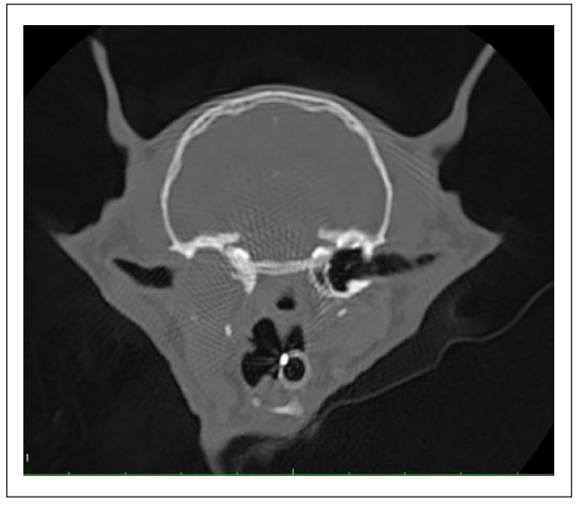
Figure 3 Transverse image of the post-contrast study (bone window) demonstrating the loss of the right bony bulla wall