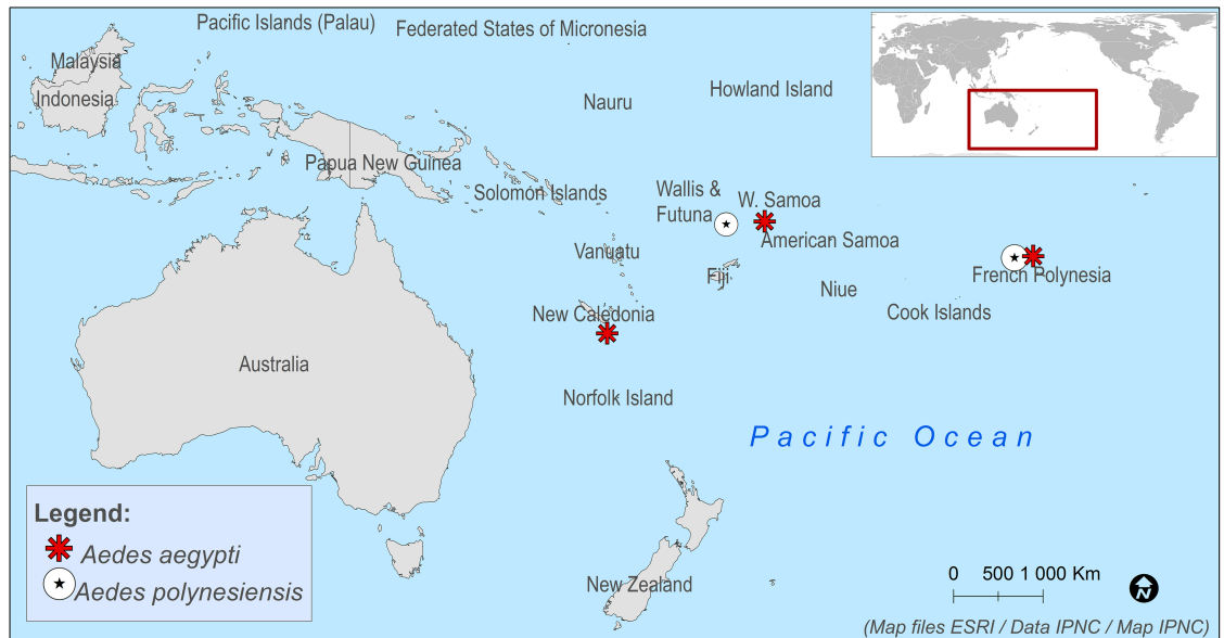
Fig 1. Pacific map locating Ae. aegypti and Ae. polynesiensis sampling sites. Ae. aegypti sampling sites are represented by the red stars and Ae. polynesiensis sampling sites by the dark star in a white dot. This map was generated using map files provided by ESRI in its ArcMap package.

For each mosquito population, 4–5 boxes of 60 five to seven day-old females, not previously blood-fed, were starved for 24 hours before infection. They were allowed to take an infectious blood meal, through a capsule (Hemotek system) covered by a pig intestine (obtained from a commercial purchased pig intestine) as membrane and containing 2 ml of washed rabbit erythrocytes obtained directly from a rabbit (New Zeland white Rabbit, Charles River) and 1 ml of viral suspension supplemented with adenosine triphosphate at 5 mM. The ZIKV concentration in the blood meal was 10 7 TCID 50 /mL. After the blood meal, fully engorged females were transferred into new containers and maintained at 28°C and 80% of humidity under a 12:12h light-dark cycle with free access to a 10% sucrose solution.