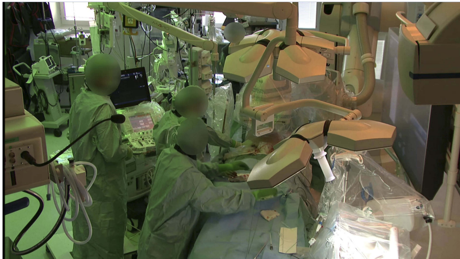
Figure S2 Two operators ( A ) and one radiographer ( B ) standing closest to the patient in Act 3.