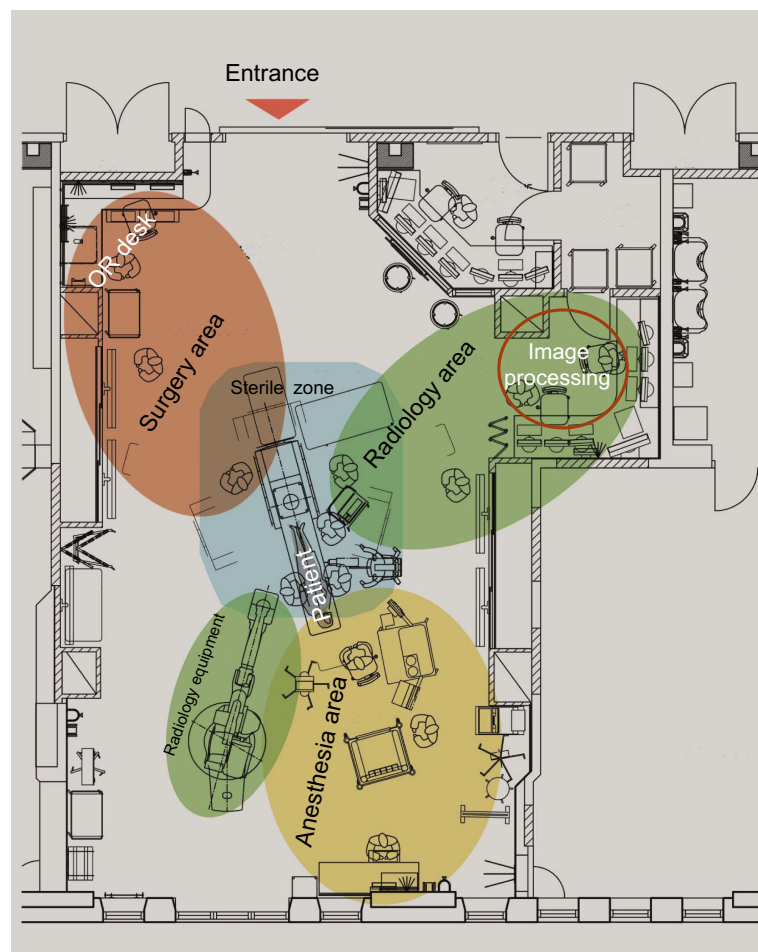
Figure 1 Landscape of the hybrid operating room.

this study. The physicians were either vascular surgeons or interventional radiologists, referred to as operators. In Sweden, the registered radiographer has a unique position, as he/she is responsible for the technical planning and execution of the entire radiological examination, as well as providing good nursing care to the patient, including administering medications and intravenous injections. The anesthesia and OR nurses both have academic specialist education; however, the assistant nurses have mainly been trained in practical aspects of the job in different specialist areas.