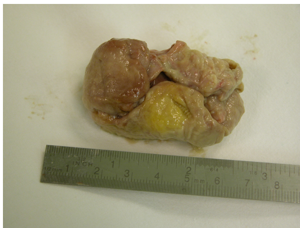
Figure 1 Relatively large necrotic fibroid spontaneously expelled transcervically 3 weeks after uterine artery embolization.

On the other hand, there are disadvantages associated with UAE. Many studies, including the abovementioned meta-analysis comparing UAE with surgery, reported a higher rate of reintervention after UAE than after hysterectomy, especially in long-term follow-up. 23,32–34 It is quite predictable that radical removal of the uterus is the only definitive treatment for uterine fibroids. Therefore, candidates for UAE should be adequately counseled about the increased