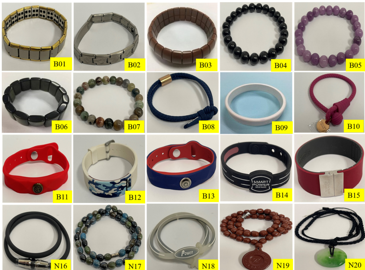
Figure 1. Bracelet and necklace samples.