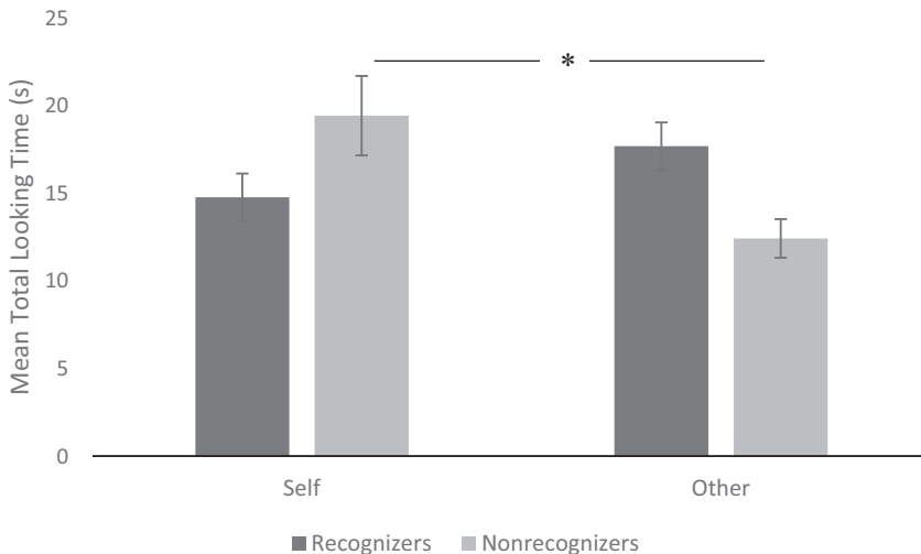
Figure 2 Mean total looking time to the self and to the other of infants who passed (recognizers, in dark gray) and did not pass (nonrecognizers, in light gray) the mirror-test task. Only nonrecognizers looked significantly longer at the self-face compared to the other-face. Error bars show standard errors (SE).

Additionally, we investigated the distribution of first look and longest look duration in the sample. We found no significant differences between the first look to the self or to the other in recognizers and nonrecognizers, \chi^2(1, N = 26) = 0.735 , p = .391 —recognizers: self (26.9%), other (30.8%); nonrecognizers: self (26.9%), other (15.4%). Similarly, we found no significant differences between the longest look to the self or to the