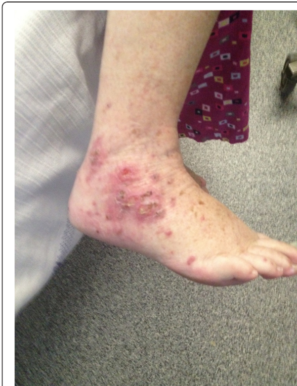
Figure 1 Photograph of the right ankle and foot showing an erythematous papular rash with ulcerations on presentation.

Hydralazine is a vasodilator that is often used as an adjunctive agent in the treatment of hypertension. Anti-neutrophil cytoplasmic antibody-associated vasculitis has been associated with many drugs such as allopurinol, sulfasalazine and propylthiouracil and is a relatively rare side effect of hydralazine. The etiology of ANCA-associated vasculitis (AAV) is not always clear and this association is less well recognized compared to drug-induced lupus which is well documented in the literature [1]. The diagnosis and management of patients may be challenging because of its relative infrequency, variability of clinical expression and changing nomenclature. The spectrum of AAV can range from cutaneous rashes and petechiae or single organ involvement to fatal multi-organ involvement with deaths commonly from massive pulmonary hemorrhage. A latency of several years can occur before the development of vasculitis with a variable delay in the full clinical manifestations [2] therefore posing a challenge for clinicians to achieve clear diagnoses and treatment strategies. This case documents a 65-year-old woman who presented with a diagnostic dilemma after developing a lower limb rash and a sore throat with Streptococcus pyogenes bacteremia and highlights the need for early recognition to enable timely cessation of the offending drug or drugs and commencement of appropriate therapy.