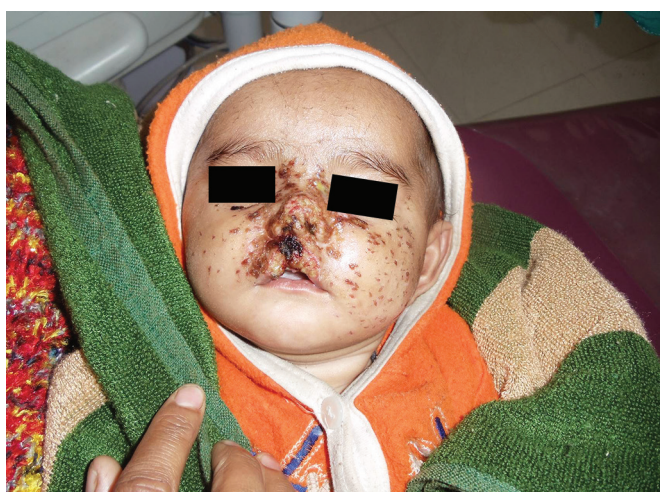
Fig. 1: View of patient during first visit at clinic; severe injuries, clefting of upper lip, and scarring noted in midfacial region