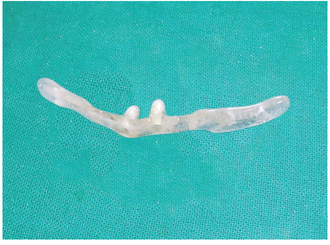
Fig. 4: Fabricated nasal stent