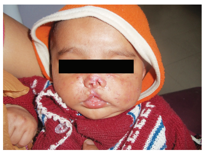
Fig. 6: One-month follow-up showing resolution of scars in face