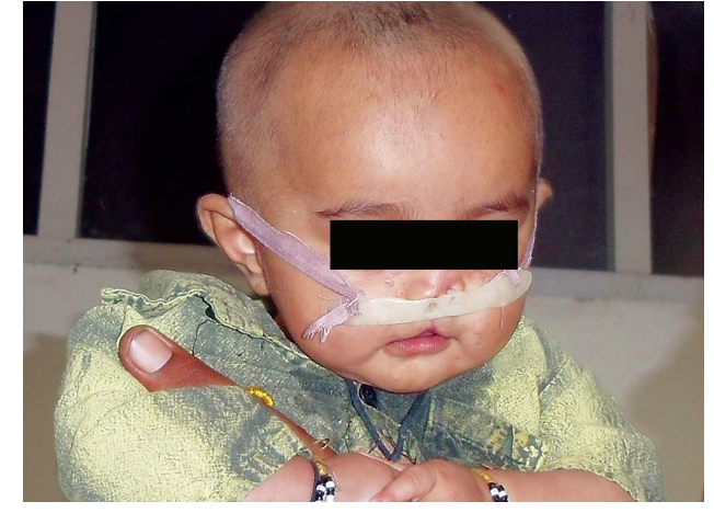
Fig. 10: Follow-up showing resolution of facial scars and continued wear of appliance at 3-month follow-up period

appliance (Fig. 7). The appliance was fabricated by investing these impressions into plaster, thus fabricating a sectional mold (Fig. 8). The impression compound in the sectional mold was replaced by a clear