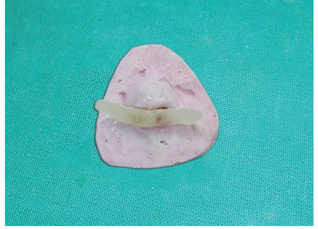
Fig. 3: Fabrication of extraoral portion of appliance made on cast from different child patient of same age