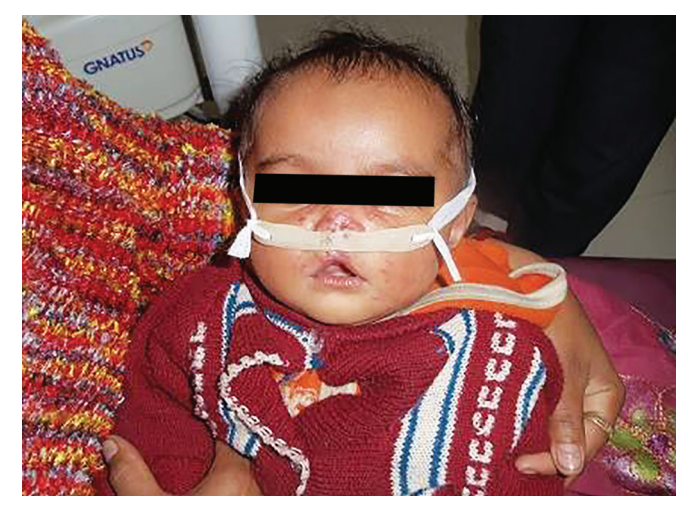
Fig. 9: Customized nasal stent in position