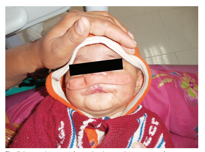
Fig. 7: Impression procedure using impression compound