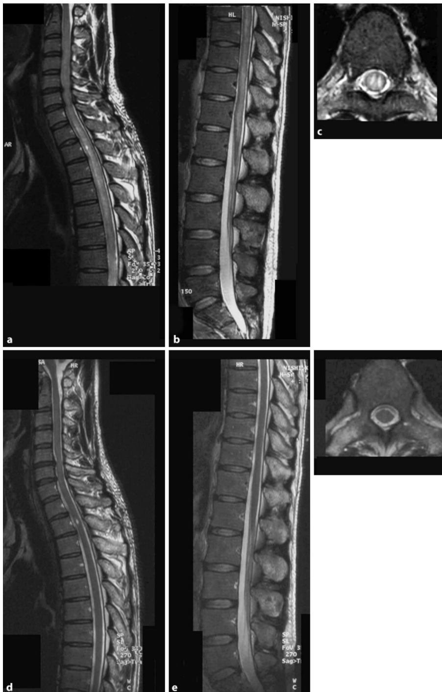
Fig. 1. a, b Sagittal T2-weighted MR images showing enlargement of the thoracic cord at the T1–T12 levels and conus medullaris associated with high signal intensity. c Axial T2-weighted MR image showing central signal intensity abnormality in cord at the T4 level. d, e Sagittal T2-weighted MR images after treatment. Abnormal lesions have completely disappeared. f Axial T2-weighted MR image after treatment. Abnormal lesions have completely disappeared.