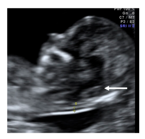
Figure 6. Case 5. Mid-sagittal plane of the fetal face to assess nuchal translucency where IT cannot be identified. The white arrow indicates the place where we should measure IT.

A 34-year-old woman G5 P3 with a history of a daughter with Down Syndrome was referred at 13.2 weeks of gestation. The fetus had a CRL of 72 mm, NT was 1.2 mm, the nasal bone was present, and the IT was absent (Figure 6). Diagnosis of spina bifida was suspected. The patient returned to our center at 21 weeks of gestation, and the US showed the typical "lemon" and "banana" signs and a lumbosacral SBA. After counseling, the patient opted for postnatal surgical repair.