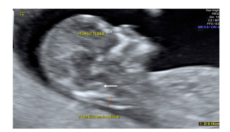
Figure 2. Case 1. First-trimester scan: Mid-sagittal view shows the thickness of the brainstem and a short distance from the posterior border of the brainstem to the occipital bone compared to the brainstem diameter (Big white arrow).

A 35-year-old patient, G3 P2 without relevant medical history was referred for first-trimester screening at 12 weeks of gestation. US findings were a crown–rump length (CRL) of 63 mm, NT of 1.5 mm, present nasal bone, and IT absence (Figure 2). The brainstem was thick, and the distance from the posterior border of the brainstem to the occipital bone was shorter than the brainstem diameter. No US markers for chromosomal anomalies were present. At 16 weeks' gestation, the diagnosis of lumbosacral SBA was made. After medical counseling, the patient opted for pregnancy termination.