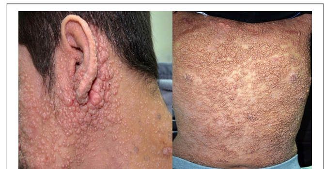
FIGURE 1 | Severe and disseminated molluscum contagiosum in a patient with dedicator of cytokinesis 8 deficiency (DOCK8) deficiency. The patient signed an informed written consent for publication of the images.