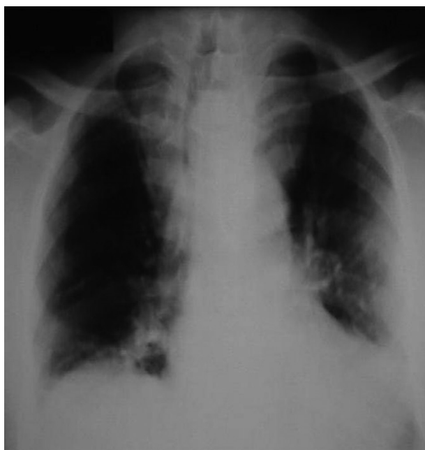
Figure 1. Chest X-ray Showing Bilateral Enlargement of Upper Mediastinal and Deviation of Trachea