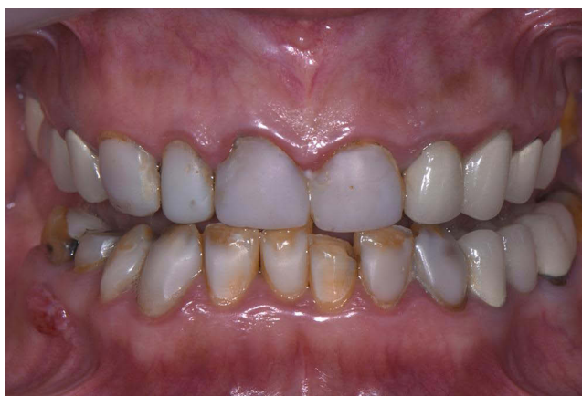
Figure 2 Pretreatment, retracted intraoral frontal view.