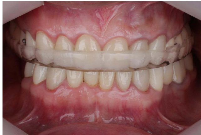
Figure 8 Inserted definitive prostheses with occlusal appliance in place.

At the end of the treatment, the smile that had been proposed and designed digitally was achieved, and the patient was satisfied. At the 1-week follow-up evaluation, the patient was happy and comfortable with her new prostheses, and a maxillary occlusal device (night guard) (Figure 8) was delivered at that time; the patient was instructed to wear it at night to protect the prostheses. The patient was scheduled for a 6-month follow-up program recall interval. After 1.5 years, she was still pleased and comfortable with her smile (Figure 9).