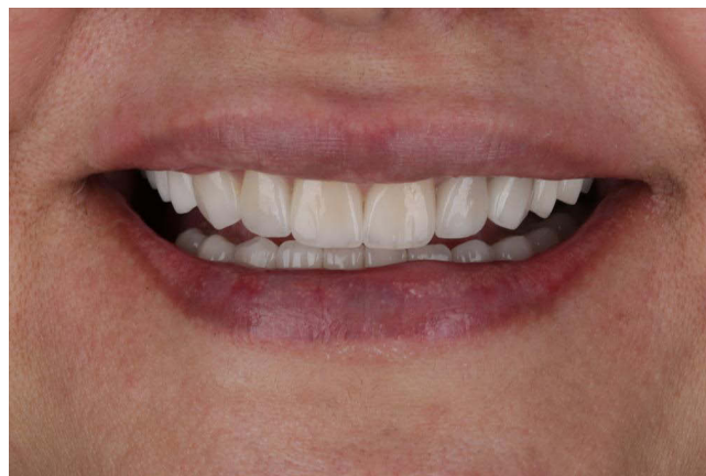
Figure 9 Smile after treatment.