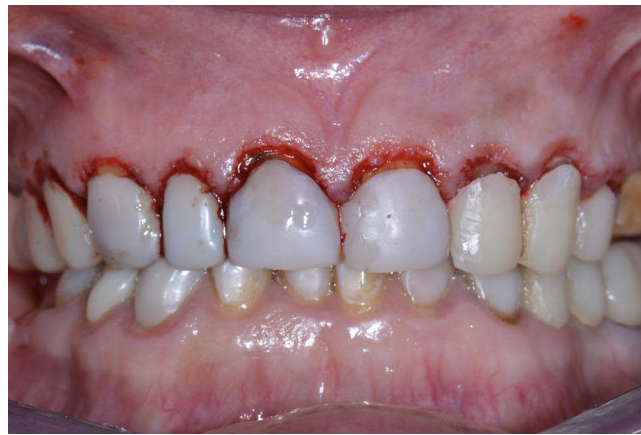
Figure 7 Primary flap design after initial incision using the surgical guide.

At the end of the treatment, the smile that had been proposed and designed digitally was achieved, and the patient was satisfied. At the 1-week follow-up evaluation, the patient was happy and comfortable with her new prostheses, and a maxillary occlusal device (night guard) (Figure 8) was delivered at that time; the patient was instructed to wear it at night to protect the prostheses. The patient was scheduled for a 6-month follow-up program recall interval. After 1.5 years, she was still pleased and comfortable with her smile (Figure 9).