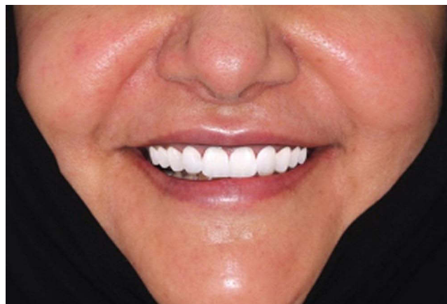
Figure 3 2D proposed smile design.

A combination of both digital and conventional workflows was followed to address the patient's esthetic and functional problems. In the planning phase, a two-dimensional 2D digital smile analysis and design software program was used to examine extraoral and intraoral digital photographs acquired from the patient using a DSLR camera. Once the patient accepted the proposed 2D smile design, an intraoral scanner (Omnicam; Dentsply Sirona Inc.) was used to obtain an intraoral digital scan of both arches. Cone beam computed tomography (CBCT) images were also obtained for both arches. Digital smile design, stereolithographic casts, and CBCT images were used to plan the correct relationship between the proposed tooth/restoration margin, future free gingival margin position, and bone level after surgical resection. The digital workflow described by Passos et al 16 was followed to 3D-design and fabricate a crown lengthening surgical guide (Figure 4A–C). Subsequently, this surgical guide allowed for accurate execution of surgical esthetic crown