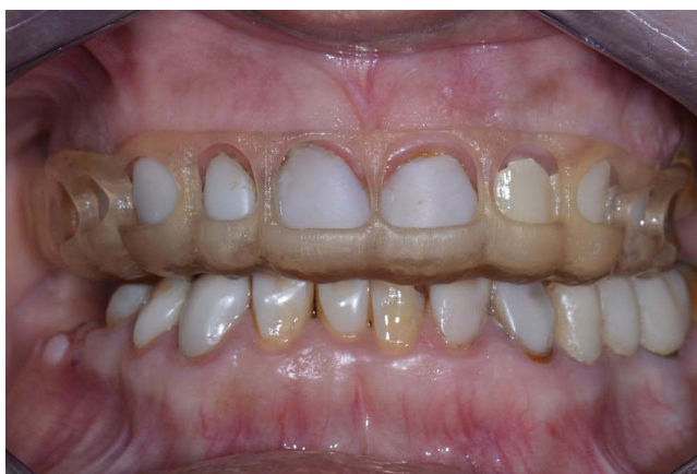
Figure 5 Surgical guide in place.

After the 3 months monitoring period, the patient was scheduled for a definitive restorative procedure. All anterior teeth received lithium disilicate pressable ceramic (IPS e.max Press; Ivoclar Vivadent AG) crowns, which were cemented using adhesive resin cement (Multilink N; Ivoclar Vivadent AG). Maxillary and mandibular posterior teeth received monolithic zirconia crowns which were cemented with resin-modified glass ionomer cement (Ketac™ Cem Plus Luting Cement; 3M ESPE) and screw retained crowns for implants.