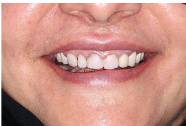
Figure 1 Pretreatment, exaggerated smile view. Note non-ideal gingival display.

This report was approved by the Dental Research Ethics Committee at Riyadh Al-Elm University, and the patient agreed and signed a consent form to publish her case details and accompanying clinical photographs. A 46-year-old woman with a noncontributory medical history presented to the Department of Prosthodontics with the chief complaint of unsatisfactory esthetics of the maxillary anterior teeth (ie, “short teeth”, defective restorations and excessive non-ideal gingival display at rest position/in an exaggerated smile) (Figure 1). The patient had high esthetic expectations. The patient reported nocturnal bruxism (parafunctional habits), and there was evidence of incisal wear and fractured composite facings in the mandibular anterior teeth. Occlusal analysis revealed Angle Class I, overjet of 1 mm, overbite of 3 mm, and mutually protected occlusion during mandibular movements (Figure 2). Clinical and radiographic examinations revealed multiple extractions, root canal treatments (RCTs),