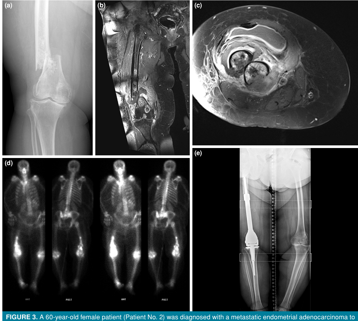
FIGURE 3. A 60-year-old female patient (Patient No. 2) was diagnosed with a metastatic endometrial adenocarcinoma to right distal femur presenting with a pathological fracture. (a) Right distal femur x-ray showing a pathological fracture with a calcified lesion. (b) Right femoral magnetic resonance imaging (T1 coronal+contrast) showing multiple bone lesions with cortical destruction and soft tissue extension. (c) Right femoral magnetic resonance imaging (T1 axial+contrast) showing adjacent soft tissue invasion and edema. (d) Total body bone scan showing the increased uptake from right distal femur. (e) A distal femoral endoprosthesis was used to reconstruct the bone defect.

The presence of BMs is accepted to be a poor prognostic factor in a wide range of solid tumors, including breast and gynecological cancers.<sup>[18]</sup> However, with a small sample size of EC with BM patients, caution should be applied, as the number of metastasis and metastasis pattern may not be transferable to all patients. Some patients have solitary lower extremity or pelvic BM with the recurrence of the primary cancer with a more favorable metastasis. On the other hand, there are some high-grade patients with multiple organ involvement together with extra-pelvic bone with