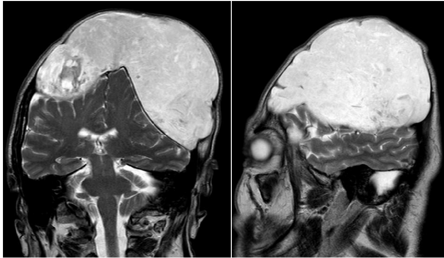
Figure 4a/b Magnetic resonance imaging T2 weighted images show the distinct compression of both brain hemispheres and ventricles due to the tumor, measuring 15 × 12 × 10 cm. An inhomogeneous high signal is shown within the tumor.

The patient also experienced no problems laying down his head on the left or right side for sleep.