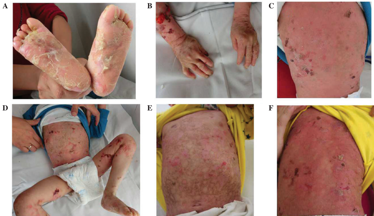
Figure 1. Clinical images of the patient in the current study. (A and B) Dystrophic or absent nails and plantar hyperkeratosis present on the first visit. (C and D) Widespread herpetiform skin blistering with post-inflammatory pigmentation over the entire body. Images A-D were captured when the child was 22 months old. No scarring is present. (E and F) Cutaneous lesions developed after 9 months. Images E and F were captured when the child was 31 months old.

samples were collected for DNA extraction. The present study was approved by the Institutional Review Board of Xinhua Hospital, Shanghai Jiaotong University School of Medicine, and was conducted in accordance with the principles of the Declaration of Helsinki. Ethical approval was obtained from the Ethics Committee of the Xinhua Hospital Affiliated to Shanghai Jiao Tong University School of Medicine.