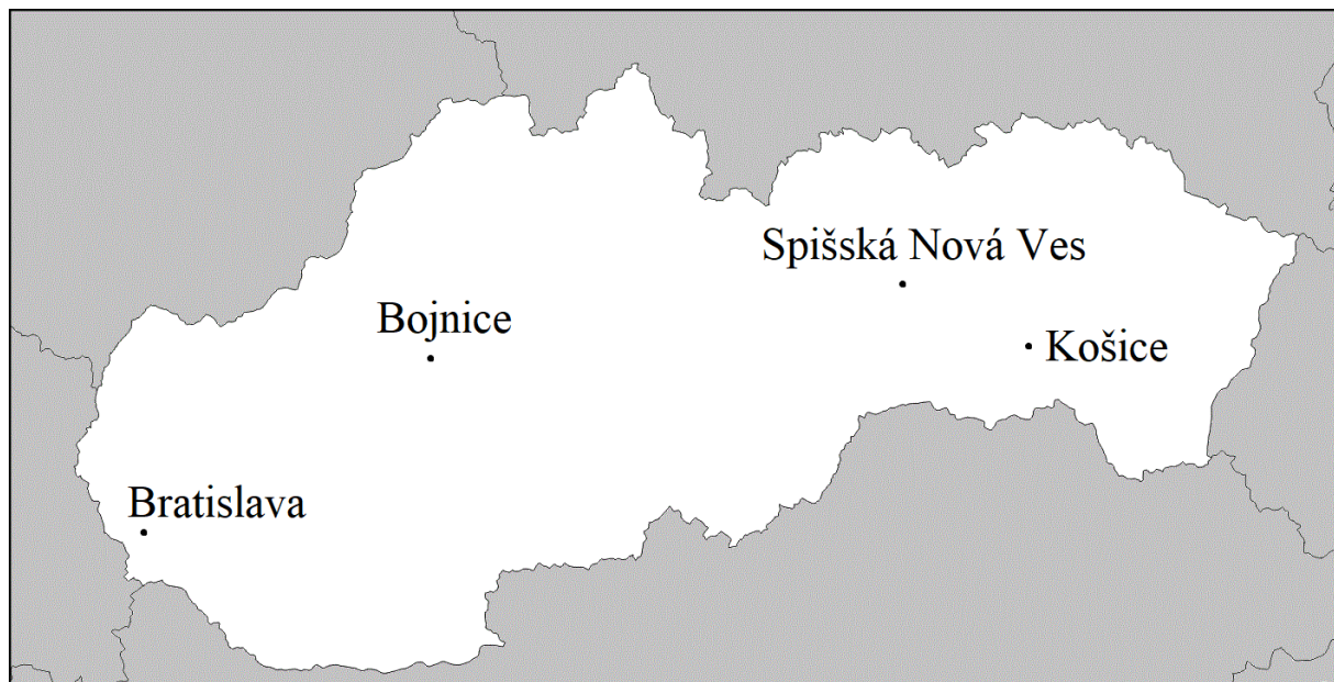
Figure 1. Map of the four Slovak zoos.