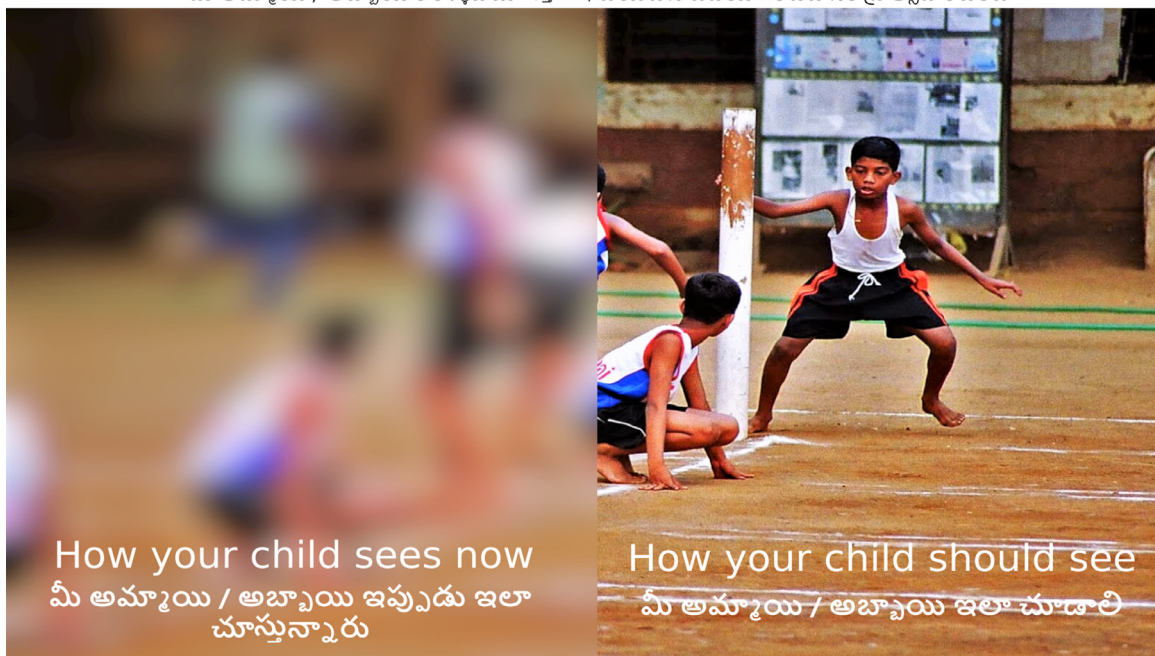
Fig. 2. Example of a PeekSim image – children playing 'kho-kho'.

Your child will be given spectacles, please encourage him/her to wear them మీ అమ్మాయి / అబ్బాయి కి కళ్ళజోడు ఇస్తాము, దయచేసి ఉపయోగించడానికి ప్రోత్సహించండి