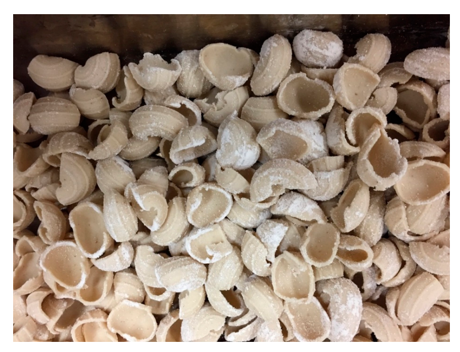
Figure A1. Breadfruit pasta (Orecchiette).