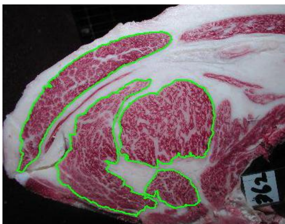
Figure 1. Overall trace method by image analysis. Muscle areas were surrounded by the boundary line which was drawn with automatic and manual traces by image analysis software.

thoracis, trapezius, semispinalis dorsi and semispinalis capitis muscles were taken with a scale using a digital camera (C-3100, Olympus Co., Tokyo, Japan) on the carcasses at meat markets. The flash unit in the digital camera was not used because the light reflectance of moisture on meat surface lead to error.