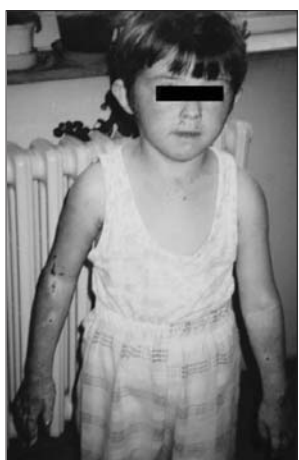
Figure 1: Age 6 years: facial appearance, blistering and scarring on the hands

The results of the biochemical investigations are