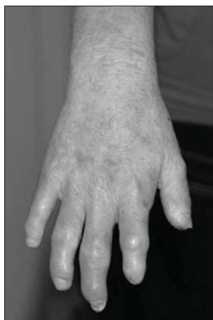
Figure 5: Age 14 years: the hands, scarring, arthrogyrosis