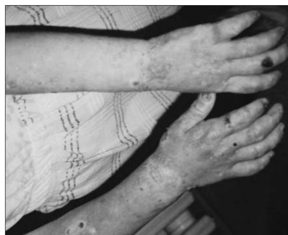
Figure 2: Age 6 years: the hands: blistering and scarring