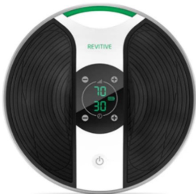
Figure 2 NMES device, 2022, Actegy. NMES, neuromuscular stimulation.