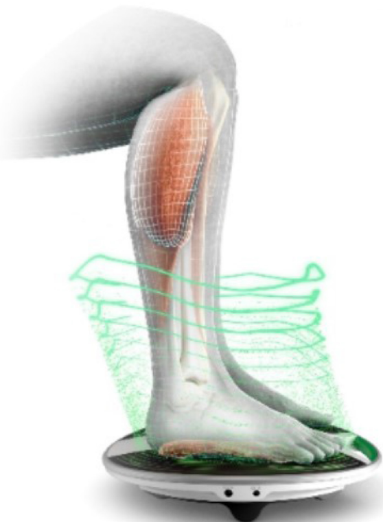
Figure 3 Device application, 2022, Actegy.