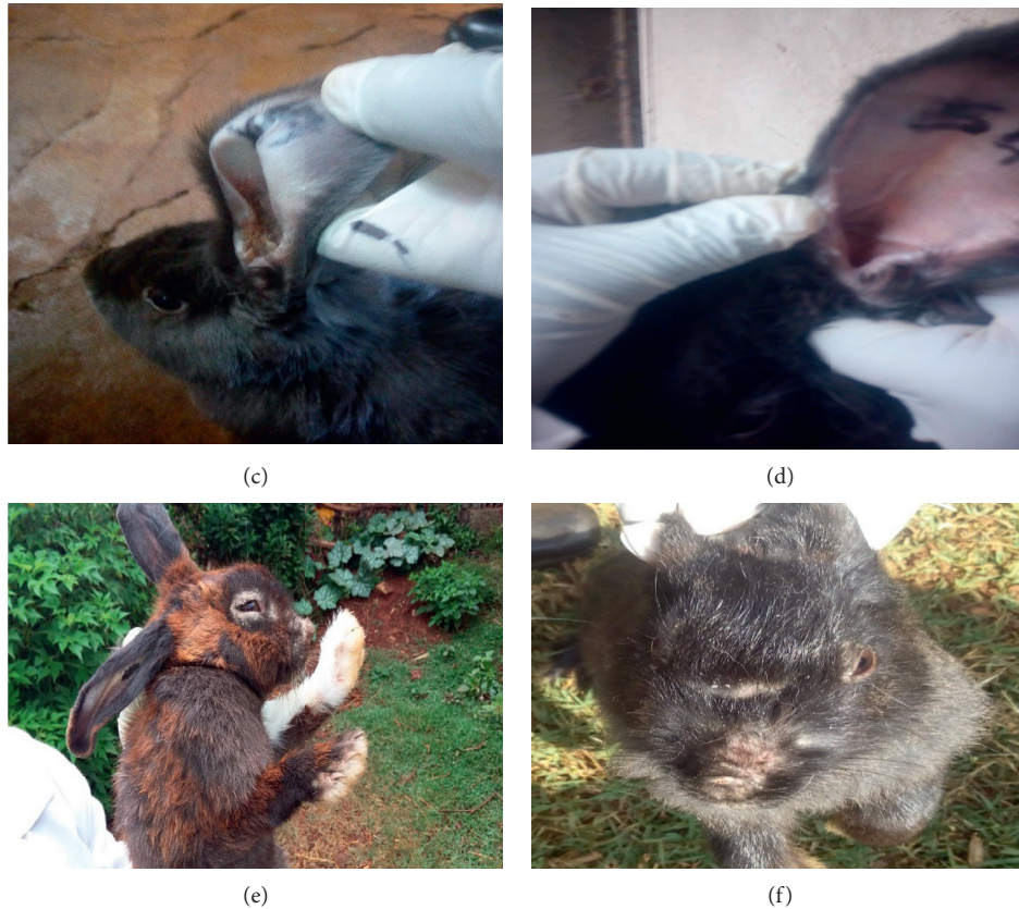
FIGURE 2: A rabbit with psoroptic mange (a) and the same rabbit after successful treatment with ivermectin (b). A rabbit with ear canker before (c) and after (d) treatment with carbaryl. A rabbit with sarcoptic mange around the mouth and nose (e) before treatment and (f) after treatment with liquid paraffin.

demonstrated for plant essential oils [31, 32] and for other plant extracts [33]. In the laboratory trial, carbaryl-liquid paraffin combination recorded the fastest action in clearing mite infestations and associated lesions compared with the use of carbaryl-water combination (as used in field trial), liquid paraffin, and ivermectin. The effectiveness of carbaryl against mites in our study agrees with findings reported by Ebrahimi et al. [34]. However, the labour-intensive nature of this treatment regimen that requires initial wetting of the lesion before carbaryl can be applied coupled by the extra cost of carbaryl may limit its adoption compared with the cheaper use of liquid paraffin alone. Further, carbaryl poses ecological and toxicological concerns that limit its application in control of ectoparasitism. The use of liquid paraffin against rabbit mange should be promoted as it is easily accessible, relatively affordable, has no known side effects, and will contribute to reduction in use of antiparasiticides such as ivermectin and carbaryl, thereby minimising acaricide resistance and accumulation of their residues in animal products.