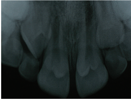
FIGURE 4: Radiographic appearance of the talon cusp.