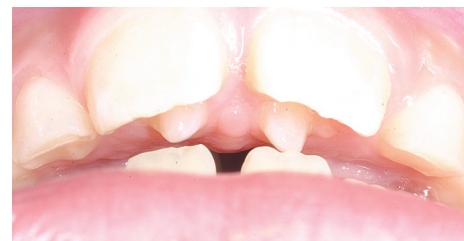
FIGURE 3: Presence of occlusal interference and premature contacts with the antagonist teeth.

(permanent lower central incisors), which had first-degree mobility (1 mm towards VL and MD; Figure 3).