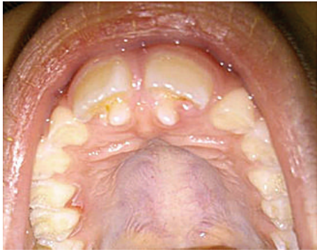
FIGURE 1: Anomalous projection elements in the region of 11 : 21.

interferences, accidental dental trauma with a high possibility of pulp exposure, caries, periodontal problems, irritation of soft tissue during speech or chewing, and exacerbated pain in the temporomandibular joints [10–13].