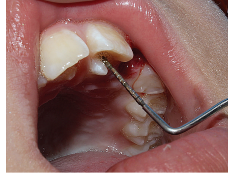
FIGURE 2: Cusp talon 6 mm in height with a probing depth of 1-2 mm.

The projection presented with Type I cusp features; it was an additional cusp of altered morphology with a well-defined prominence that featured a talon protruding from the lingual extension, with more than half of the clinical crown of the tooth extending to the cemento-enamel junction. The groove had retained biofilm and food waste due to cleaning difficulty, but there was no trace of carious processes. Subsequently, it was observed that the size of the anomaly created an occlusal interference and premature contacts with the antagonist teeth