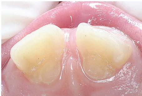
FIGURE 5: Final aspect of treatment.

regions were properly sealed with sealant pits and fissures (FluroShield Dentsply) that release fluoride (Figure 5).