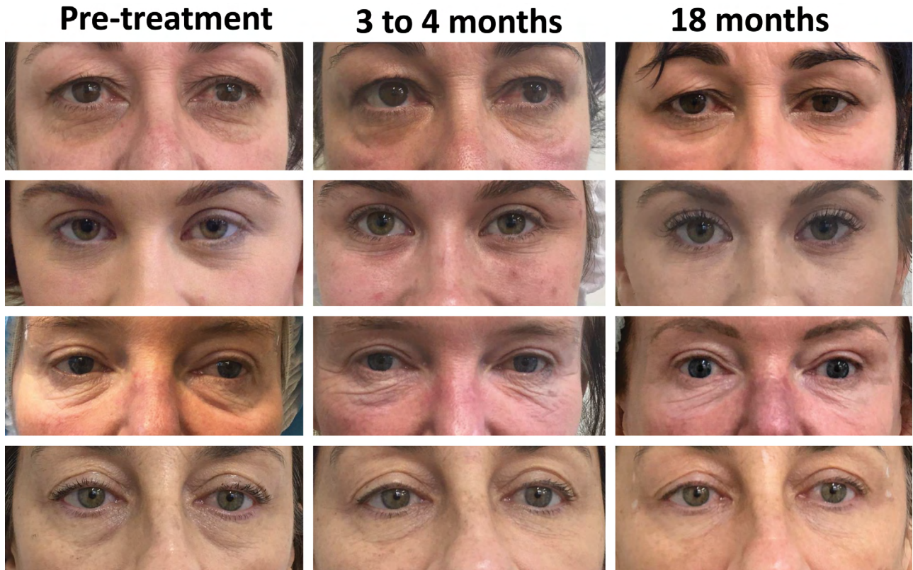
Fig. 3. CaHA filler–mediated correction of the TTD at 4 and 18 months. Patients have visible signs of continued improvement in skin quality beyond 4 months. A second treatment was given to patient 1 at 4 months and patient 3 at 6 months.