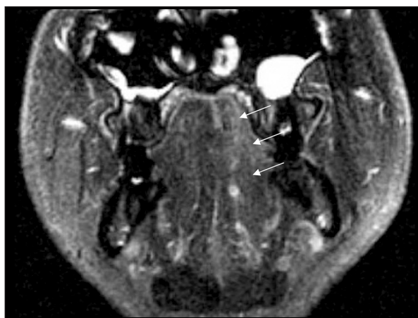
Figure 2. Coronal T2-weighted image showing asymmetrical prominent fatty striations and fatty atrophy on the left side of the tongue due to radiation toxicity (arrows).

denervation changes confined to the muscles supplied by the left hypoglossal nerve. There was no evidence of widespread motor neuron disease or myokymia, and EMG findings in the right side of the tongue and cervical muscles were normal. The patient's slurred speech and dysarthria have persisted, and he continued to follow up with a speech therapist.