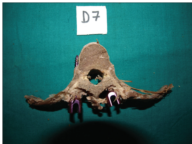
Figure 1: Lateral wall violation as seen on macroscopic examination

Pedicle screws were placed from D5 to L5 level in 10 cadavers. A total of 260 pedicle screws were inserted. The surgeon and the resident placed 130 screws each. Out of 130 screws, each of them placed 65 screws by freehand and 65 by image-assisted technique.