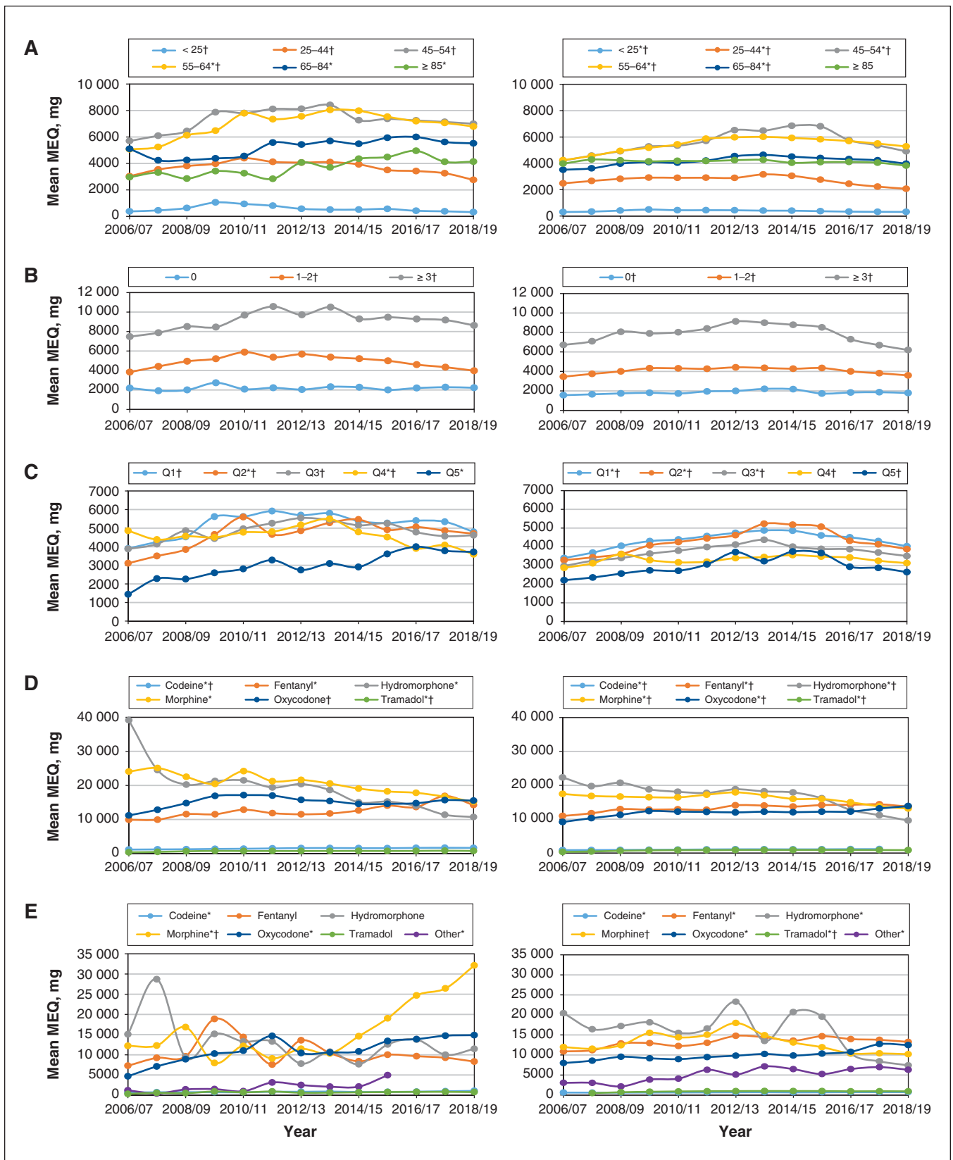
Figure 2: Time trends in prescription opioid morphine equivalents (MEQ) among Red River Métis (left) and all other Manitobans (right). A) Time trends by age group (years). B) Time trends by number of comorbidities. C) Time trends by income quintile (Q1 = lowest, Q5 = highest). D) Time trends by opioid type. E) Time trends for people in income quintile 5 only, by opioid type. p < 0.001 for difference between Métis and other Manitobans for each opioid type. Note: p < 0.001 for difference between Métis and other Manitobans for all comparisons. *Linear trend significant. †Nonlinear trend significant.