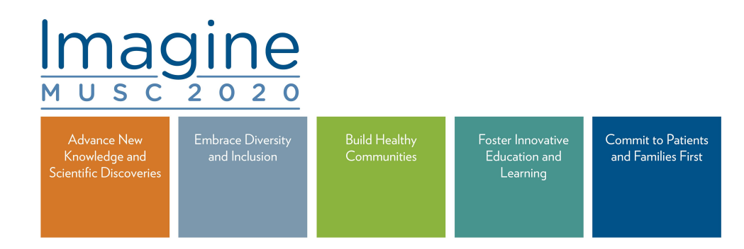
Figure I MUSC strategic plan graphic.

emphasizes both the role of personal development and that of effective interaction with other people and systems to create desired results.