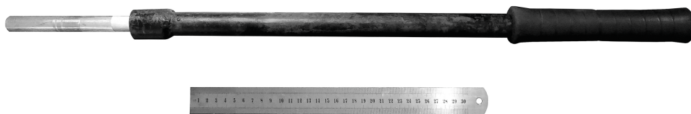
Figure 1 Bite Force Measuring Tube (BiTu). Overview of the Bite Force Measuring Tube (BiTu) device with an aluminum tube attached and fixed with a lateral screw in the tip of the steel rod (not visible in the image).