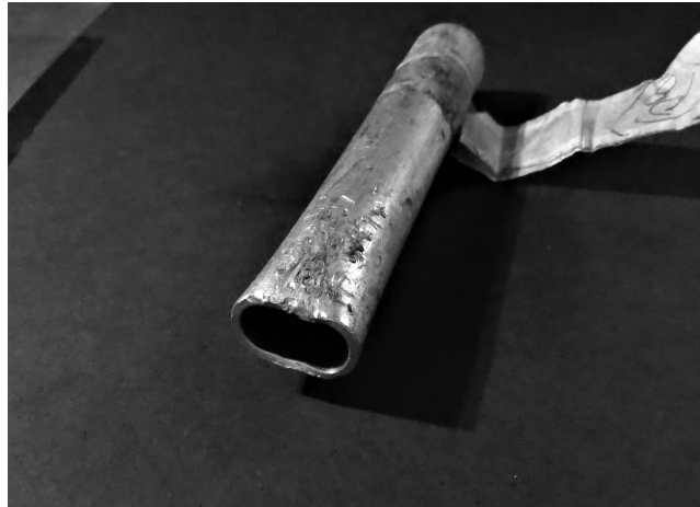
Figure 4 BiTu tube deformed after being bitten. The aspect of a tube deformed after a feral hog bite. There is a clear alteration of the tube's original diameter. The difference between the original external diameter and the deformation denotes the displacement corresponding to a compression force. The tooth marks on the tube's surface were not considered and only the full effect of the jaw occlusion was registered. The tubes were tagged for posterior measurement and museum cataloging.