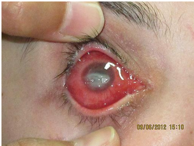
Fig. 3. Anterior segment ischemia and phthisis bulbi in the right eye.