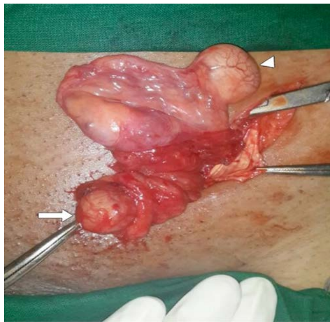
Figure 1. Intraoperative photo showing undescended testis (arrow head) at deep inguinal ring and normal testis (arrow) delivered through inguinal incision along with normal cord structures.